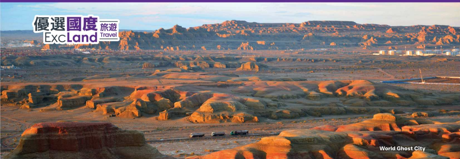
World Ghost City