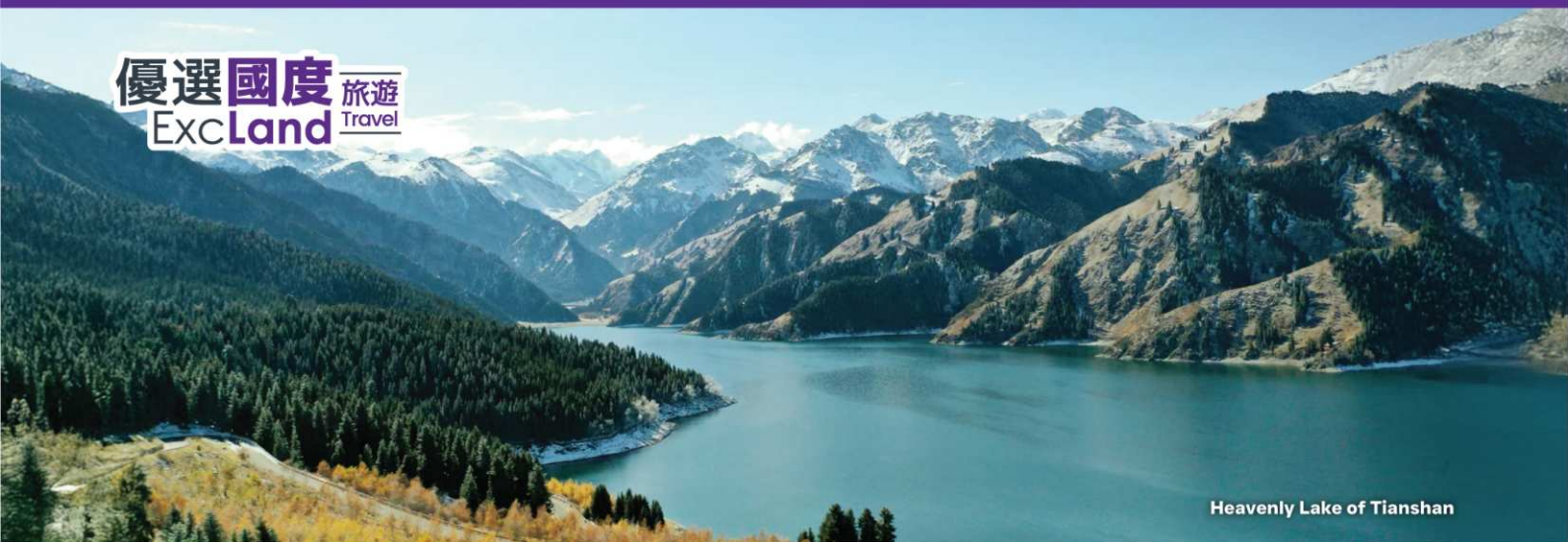
Heavenly Lake of Tianshan