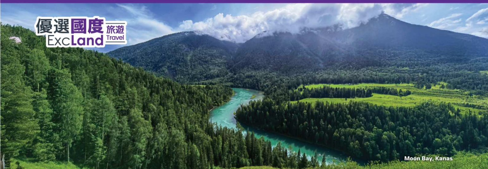
Moon Bay, Kanas