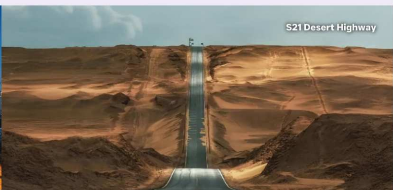
S21 Desert Highway