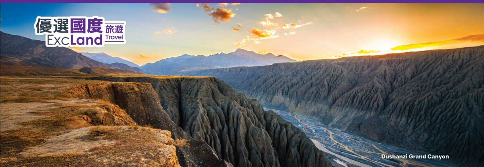
Dushanzi Grand Canyon