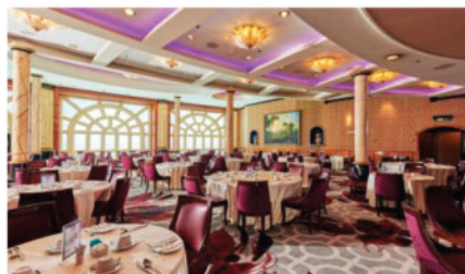
Dream Dining Room

總噸位 75,338 噸 載客 Guests 1,856 人 甲板 Decks 13 層